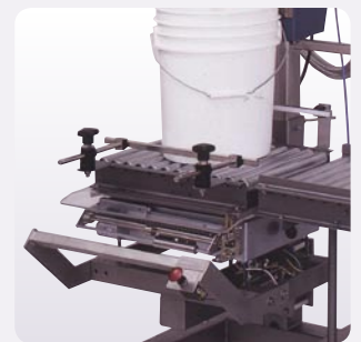
135 lb. X 1 oz. Capacity Scale

Please contact Data Scale to discuss specific machine options.