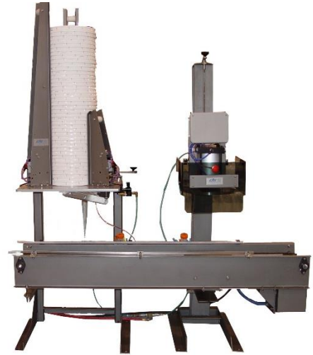
Lid Placer Automatic Lid Press (ALP)