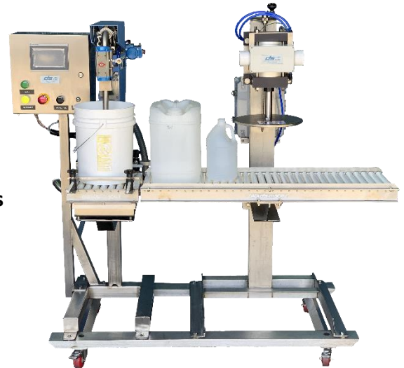
501-S Semi-Auto Press (SALP) on Portable Cart